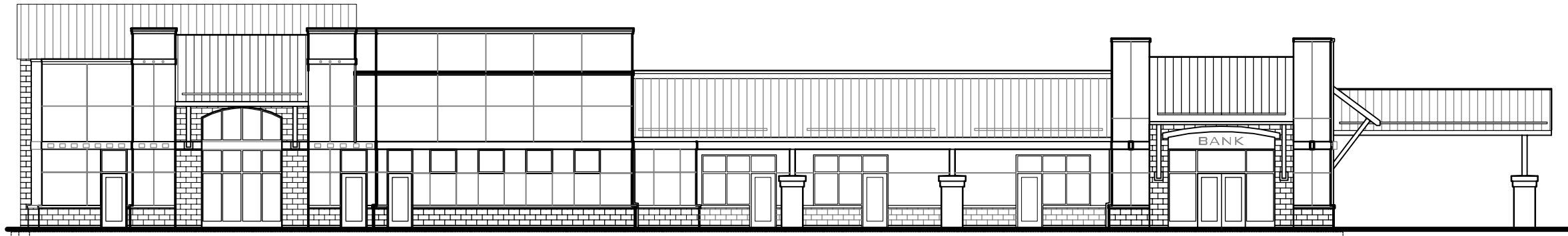
① SOUTH ELEVATION SCALE: 1/16" = 1'-0"