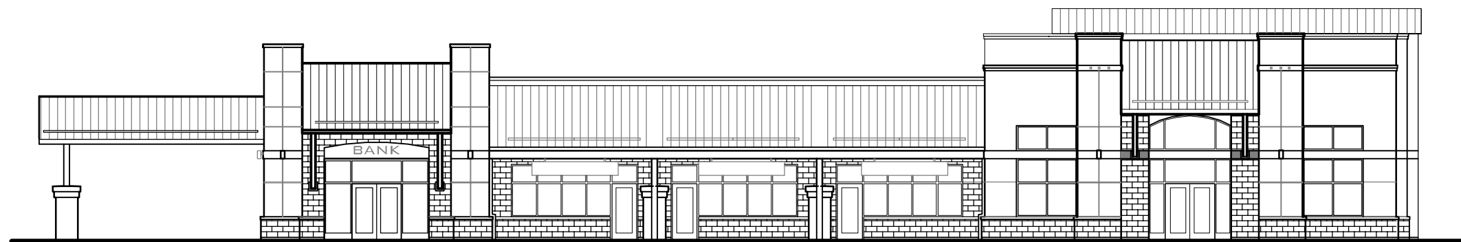
④ NORTH ELEVATION SCALE: 1/16" = 1'-0"